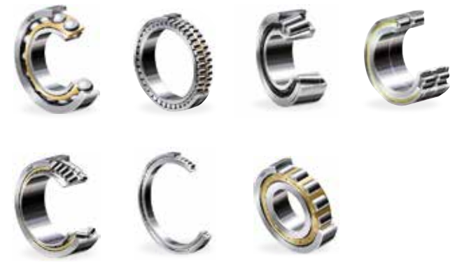
Cylindrical roller bearings / Ball bearings Tapered roller bearings / Spherical roller bearings Agri-Units / Bearing units / Electrically insulated bearings

NKE develops and manufactures premium quality bearings for a wide spectrum of industrial applications .